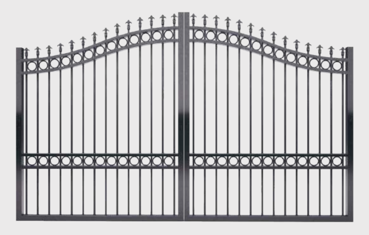
Oxley Ring Double Colonial Curve: Double colonial curves accented with timeless Oxley ring features.

A striking pinnacle curve with protective doggy bars and traditional Melrose spear.